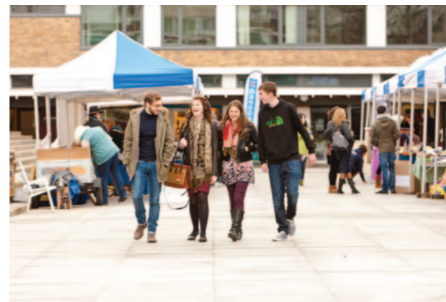
Weekly market during term time