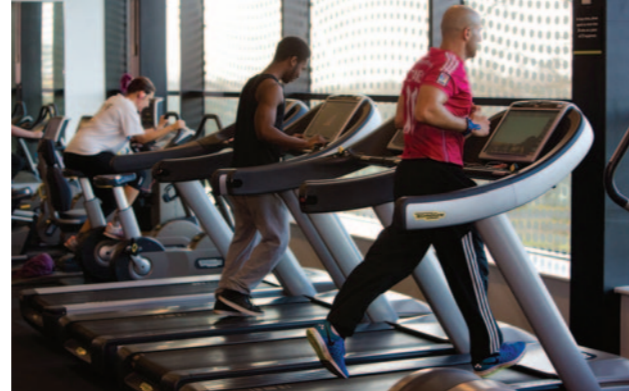
100 station fitness suite