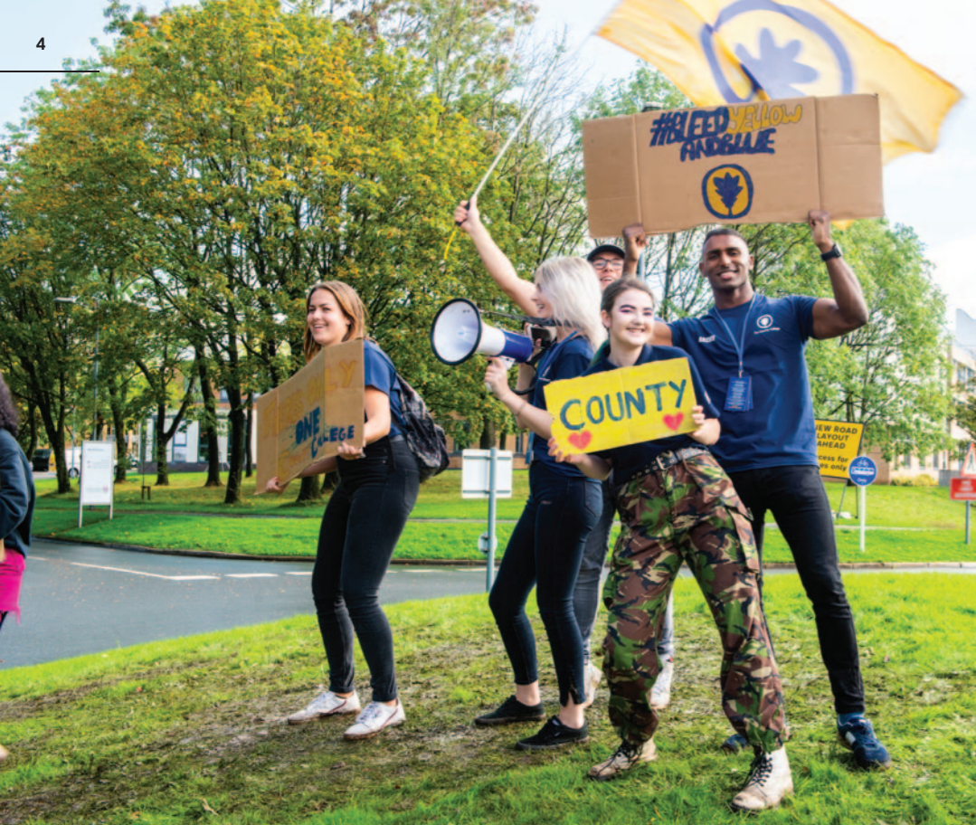
Moving in weekend

"From my first day here, the college has supported me in feeling at home, and supported me in getting the most out of my time here."