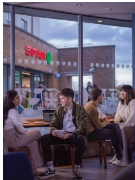
Costa and Spar