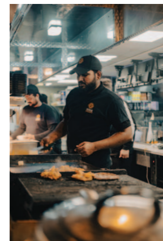
Sultan of Lancaster