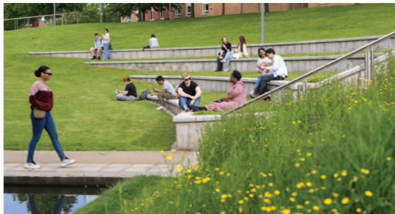
The Bonington Step

For more information, please visit lancaster.ac.uk