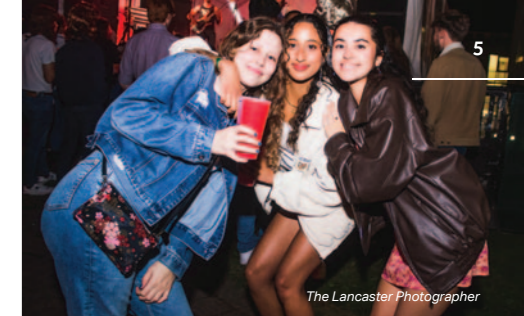
The Lancaster Photographer