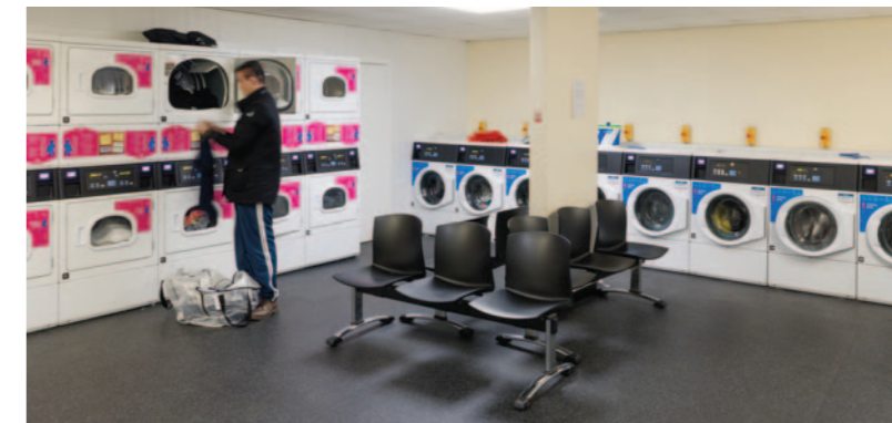
One of many launderettes on campus

As well as the things you want for a great time on campus, there's also everything you need to live comfortably. Launderettes, a post office, medical centre, pharmacy, hair salon, barbers and more means you don't have to travel far.