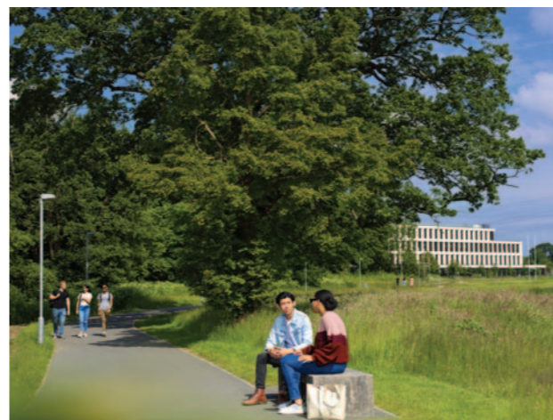
Cycle route to the Health Innovation Campus