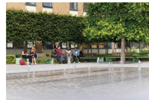
Great Hall Square

Whether you love the sun or like to wrap up warm for a winter walk, our beautiful campus will set the scene for your student life. Our campus is stunning no matter the season.