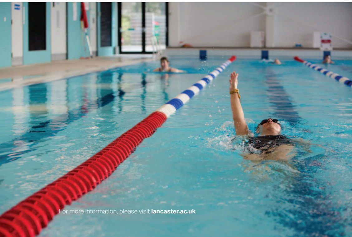
25m swimming pool

For more information, please visit lancaster.ac.uk