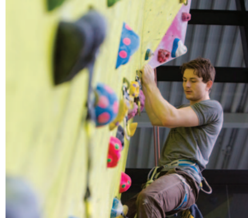
8.5m climbing wall