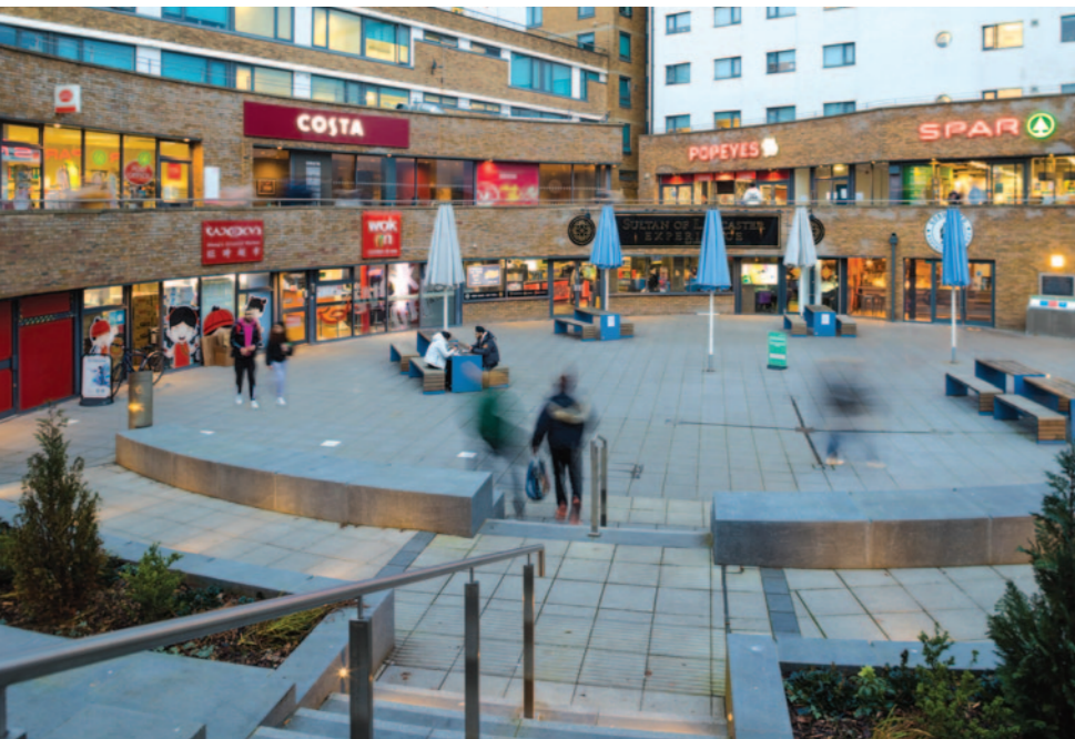
Edward Roberts Court

"Campus has various grocery stores, restaurants, a pharmacy, gym, etc. that made the overall living experience very convenient and enjoyable."