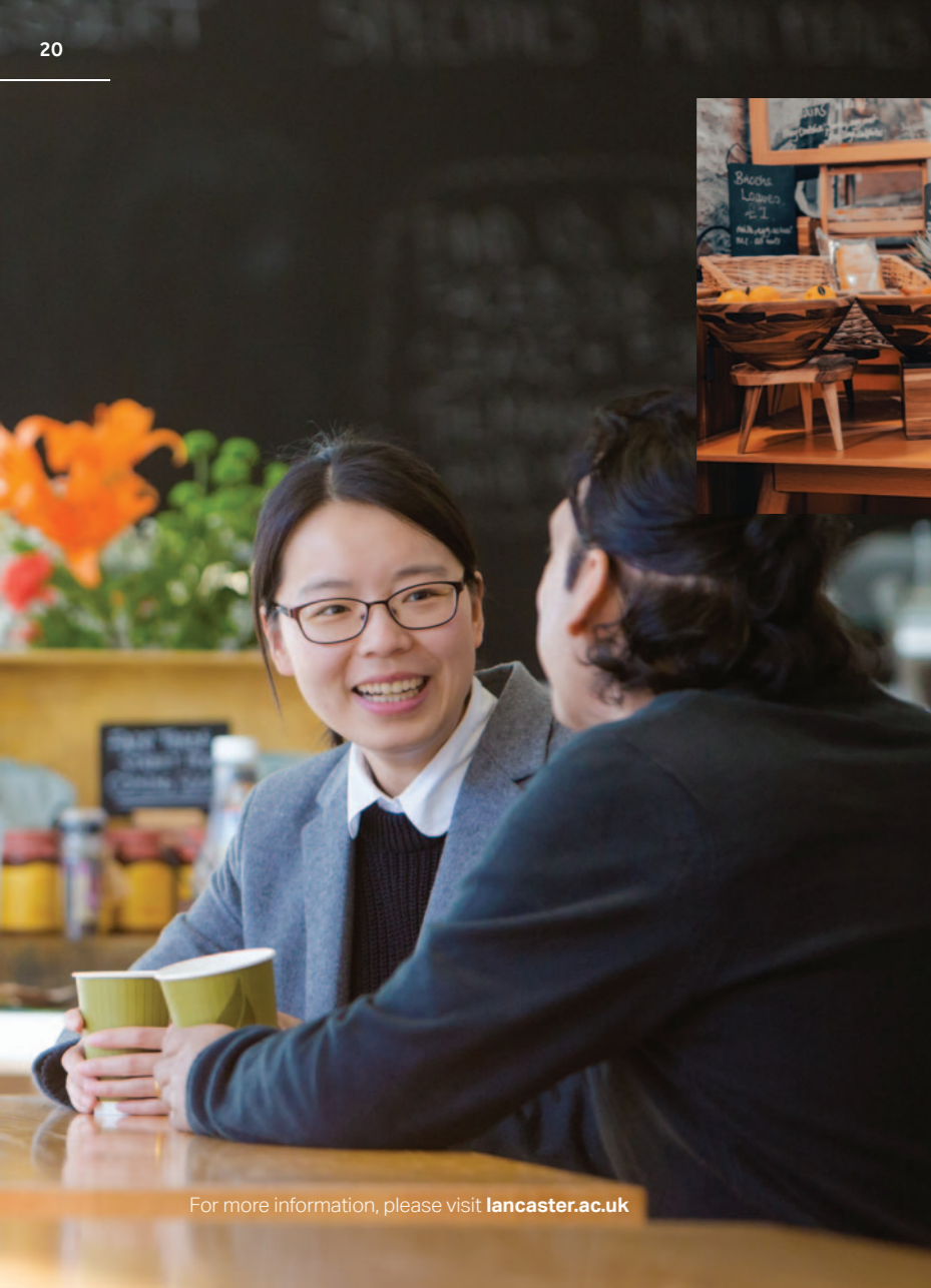
Starbucks at Barker House Farm