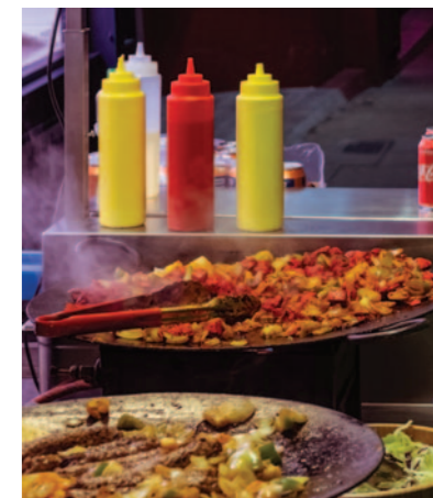
Weekly market during term time

"Everyone's first choice for lunch is Greggs, to avoid the queue I recommend Pizzetta or Subway for a sandwich."