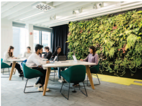
Living wall in the library

"The wildlife living around the accommodation is so special. It's nice to look out a window and see a rabbit, squirrel or a duck. They make great neighbours!"