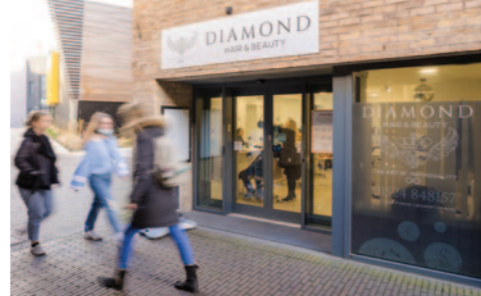
Hair and beauty salon

For more information, please visit lancaster.ac.uk