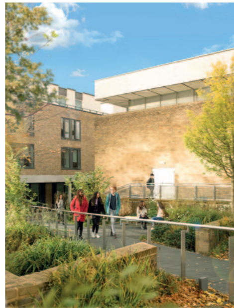
Great Hall Court