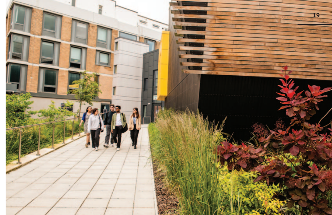
Margaret Fell Lecture Theatre