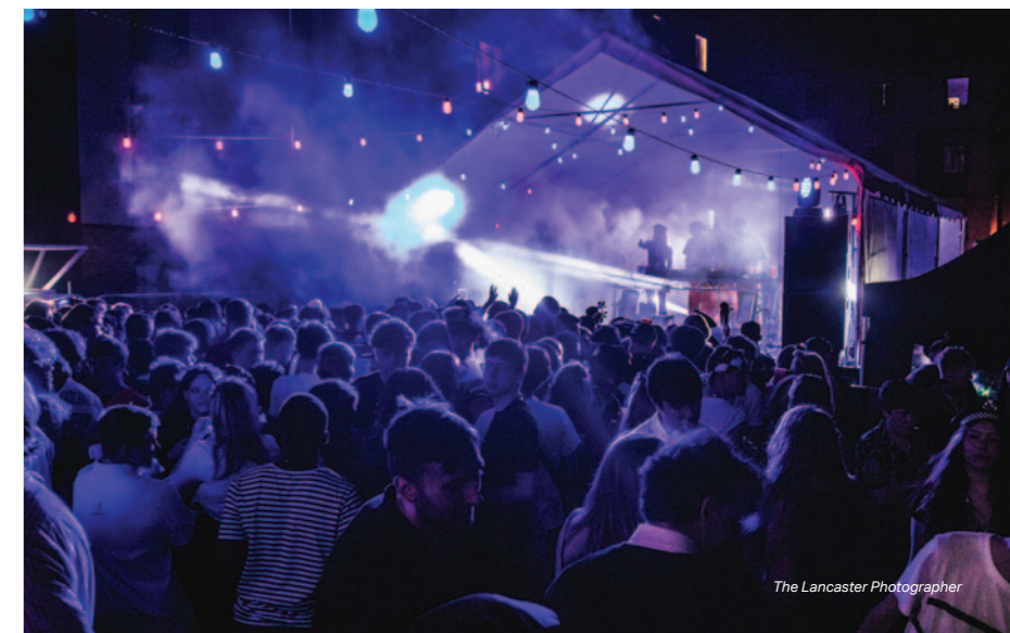
The Lancaster Photographer