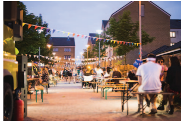
Summer Extrav celebrations