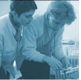
A BIT OF HEAVEN FOR THE FEM? Journal of Palliative Care, 2009