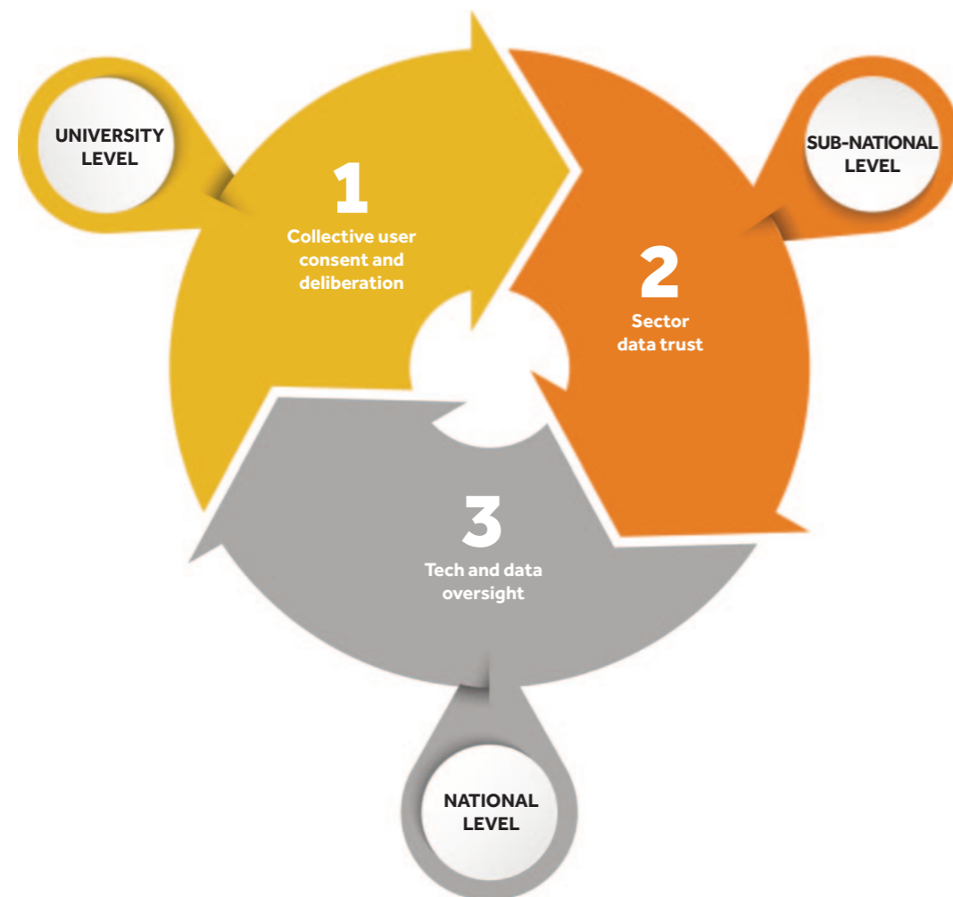
Figure 2. Three dimensions of technology and data governance in higher education

These proposals for discussion are organised into three dimensions at different levels. Together, they represent a holistic and cross-cutting intervention in technology and data governance to support individual rights, institutional progress, and fair market competition and innovation.